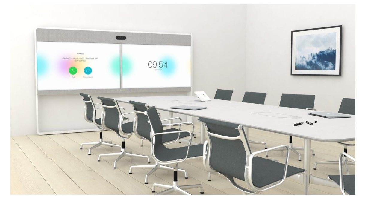
Figure 2. Cisco Webex Room 70 G2 in a large conference room